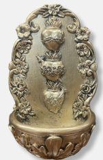
SACRED HEARTS HOLY WATER FONT

New & lapsed donors ($10 a month) or existing donors (add $10 to their monthly pledge)