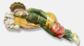
SLEEPING ST. JOSEPH STATUE